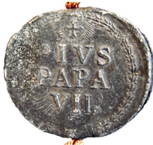
Bulla Sub Plumbo Pastor Aeternus