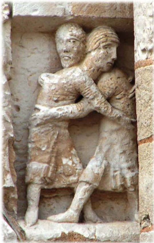
Facade of the cathedral in Poitiers (France)

INFO SSCC Brothers No 94 – September 4, 2015